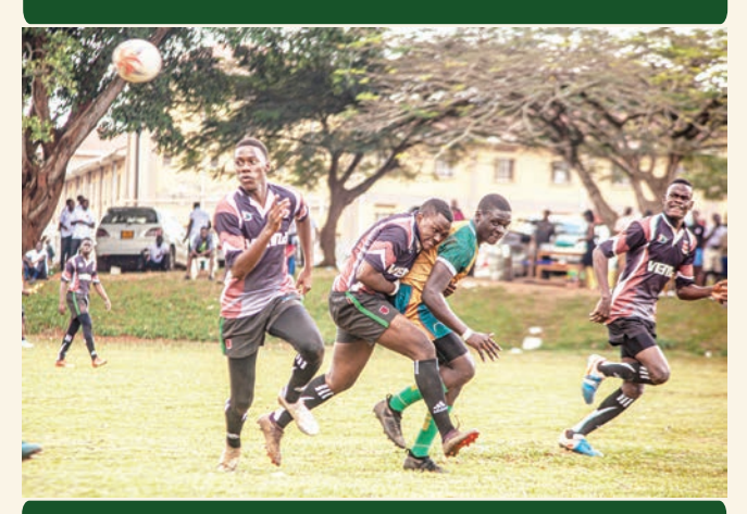
Vienna Rugby Titans in action