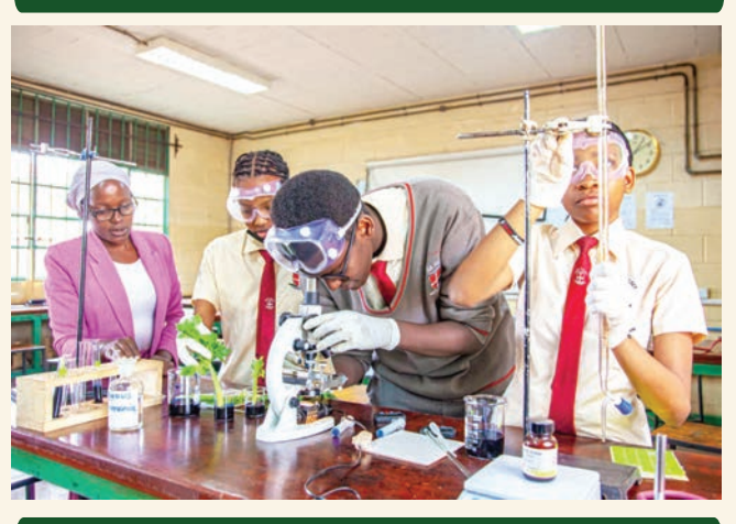
Innovative and Practical Learning