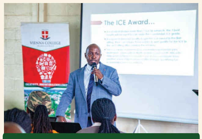
Year 9 parents careers' Conference