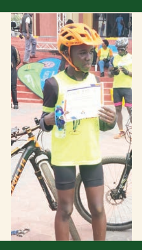
Training, Endurance and Achievement